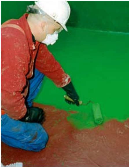
Application of SikaGard 62

Leading cable manufacturers Pirelli, wanted to permanently seal and make watertight an important chemical containment bund at their Merseyside plant, and also prevent any possible leakage into the environment.