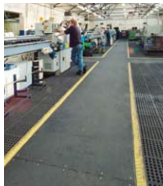
Safe non-slip walkways

NWS were instantly able to recognise a virtually 'tailor made' solution to Bright Screws problem-recommending and supplying Ronadeck TackTile Sheets. These were quickly and easily mechanically fixed into the contaminated floor, providing slip and skid resistant walkways around, and between, the high precision equipment for their personnel.