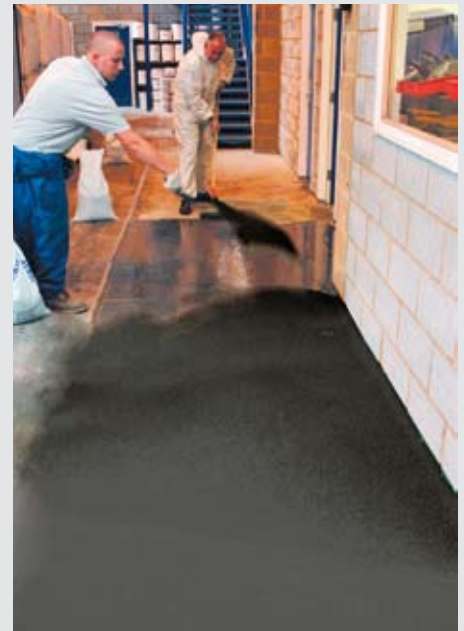
Broadcasting the non-slip aggregate

To support and assist the Hawkins' Team, NWS also provided their "Site Supervisory Service" and all of the most critical areas were quickly treated and brought up to the clients' non slip and anti skid requirements, even in their partially exposed location.