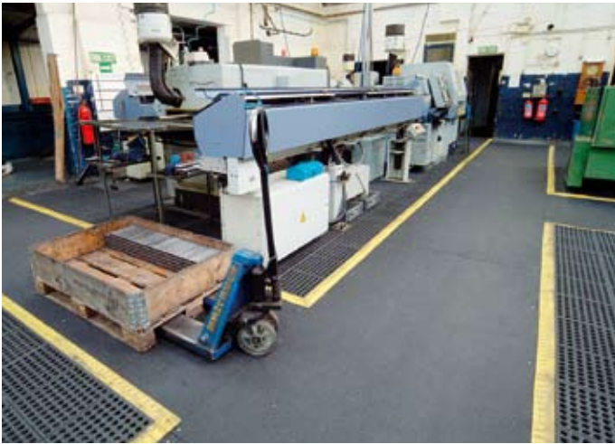
NWS supplied Ronadeck Tacktile Sheets to make safe the floors in the Bright Screw machine shop